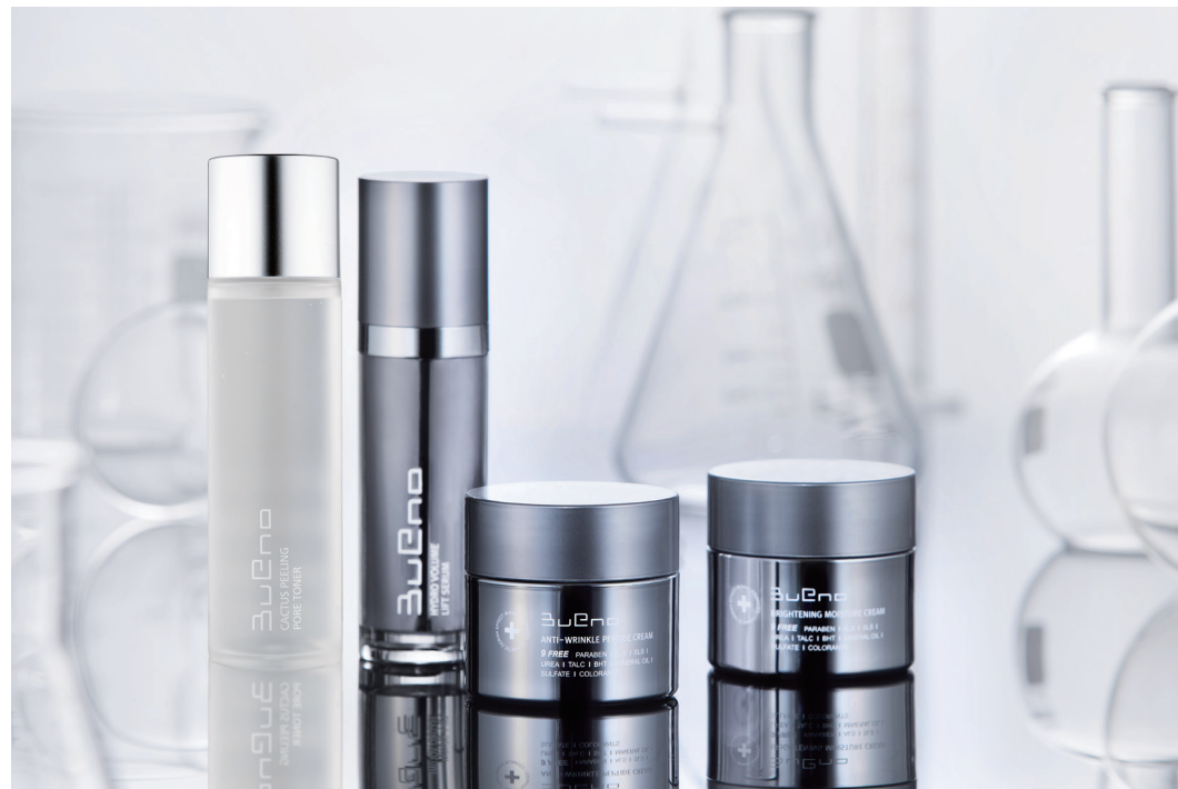
CACTUS PEELING PORE TONER HYDRO VOLUME LIFT SERUM BRIGHTENING MOISTURE CREAM ANTI WRINKLE PEPTIDE CREAM